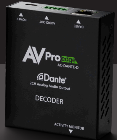
*shown with AC-DANTE-D